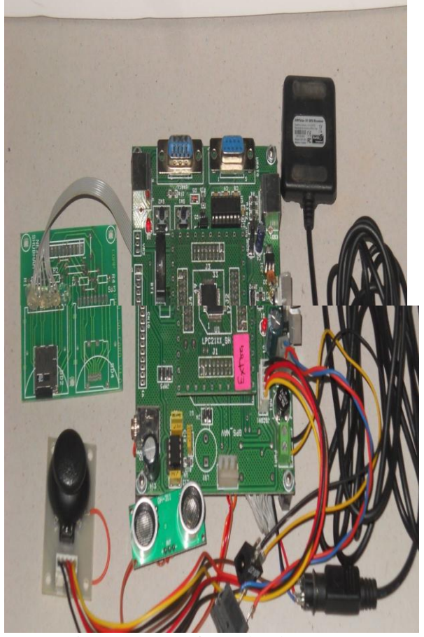
Fig: 5.1- Image of completed system

[4] 2008, Sakmongkon Chumkamon, Peranitti Tuvaphanthaphiphat, Phongsak Keeratiwintakorn, A Blind Navigation System Using RFID for Indoor Environments, Proceedings of ECTI-CON:765-768