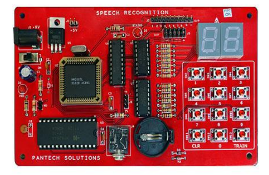
Fig: 3.1 – Speech Recognition Kit

It is a single chip CMOS voice recognition LSI circuit with on-chip analog front end, voice analysis, voice recognition process and sound control functions. An intelligent recognition system can be built using a 40 isolated –word voice recognition system is composed of external microphone, keyboard, 64K SRAM and other components combined with the microprocessor.